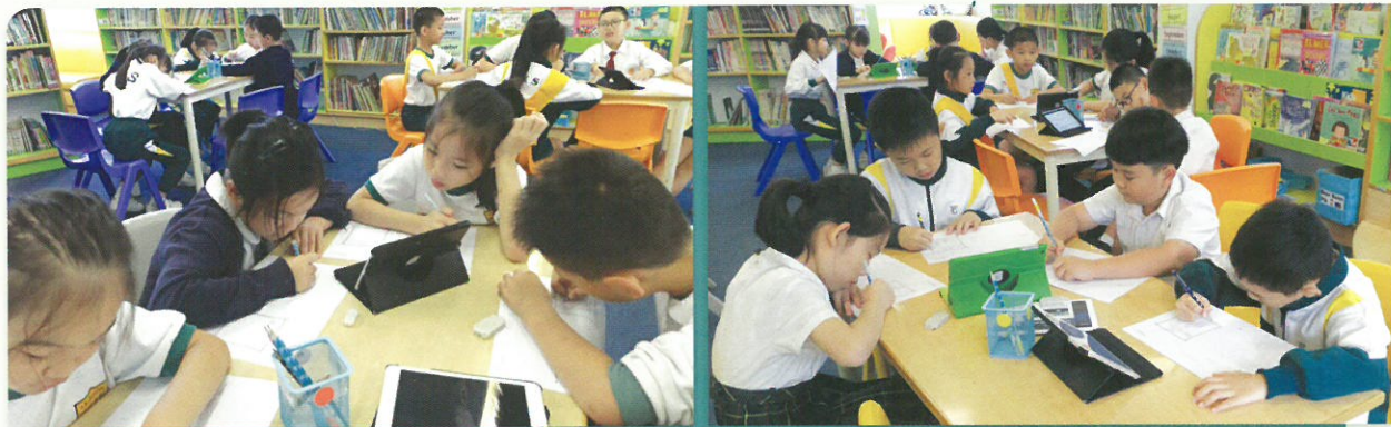
Collaborative e-Learning in the classroom

Reflecting on the implementation of the unit, the teachers found that student collaboration and group communication were necessary to complete the multi-tasks assigned. Research from the Internet needed to be moderated by students through exercising their critical thinking and problem-solving skills. According to Fullan (2014) (see diagram below), these are important 21st century skills required for the well-being of society. Teachers were also challenged to change: while once familiar with delivering 'chalk-front' lessons, they now need to assume the role of a facilitator in developing students' information literacy.